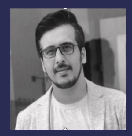
Chief Influencer - Talent Seeker Communities